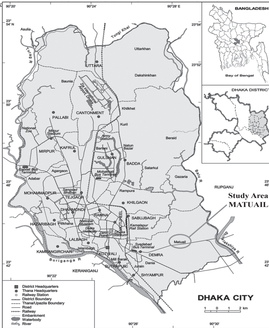
Figure 2: Map of The Study Area

One of the study areas is the largest government-approved sanitary landfill located at Matuail in DSCC. with another located in DNCC. These areas are chosen based on the availability of waste workers and recyclers. There were three possible methods for the survey: face-to-face interview, telephone interview, mail and google form. Among these methods, this study chose face-to-face interviews and mobile phone conversation because the quality of the data obtained by this method has been found to be the most complete, comprehensive, and meaningful. All the responses were measured on a 10-point “Likert” scale with 1 = Strongly Disagree and 10 = Strongly Agree. Structural Equation Modeling (SEM) is the second generation statistical method widely employed by researchers nowadays to analyze the interrelationships